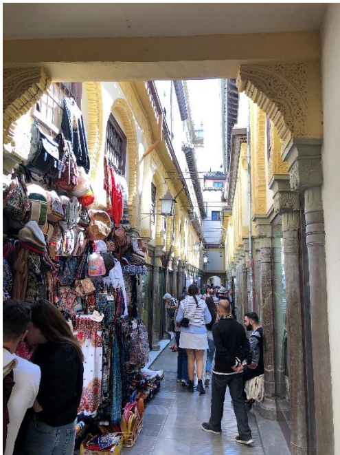
Exploring Granada: Albacin, Moorish area with bazar shops and souvenirs

Villamena (España) Tel.: (+34) 958 777 092 Email: reservas@senoriode Nevada.es