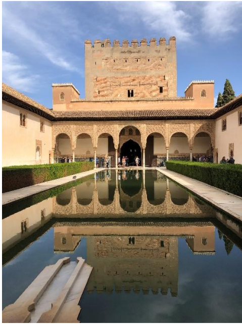
Exploring Granada: Alhambra

Granada is one of the most charming cities in Spain. Thousands of tourists come to it every year to get to know it through the streets of its traditional neighbourhoods. The main enclaves and monuments create a fascinating halo which captivates anyone who comes to visit it.