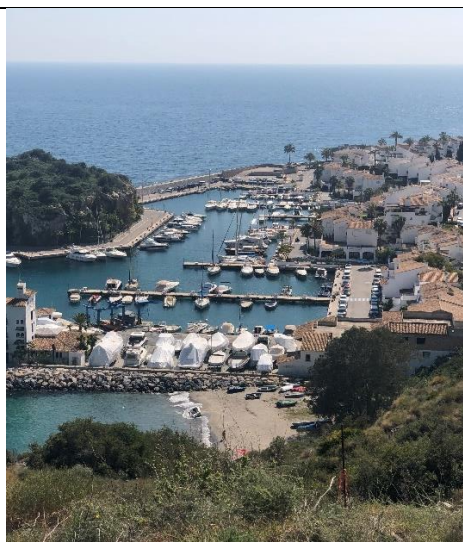
Marina Del Este Yacht Harbour

Location: https://goo.gl/maps/xdzshoKjjmrZDYTE8