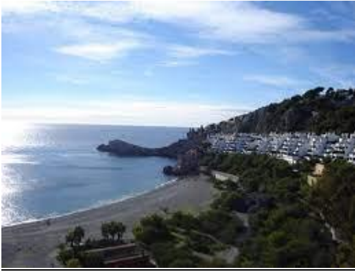
Peñon del Lobo viewpoint

From this viewpoint you can enjoy stunning views of Puerto de la Herradura, both during the day and at night. If you want to take a great photograph, visit this place during the full moon. It forms part of a hiking route, of which there are many in this area of Almuñecar.