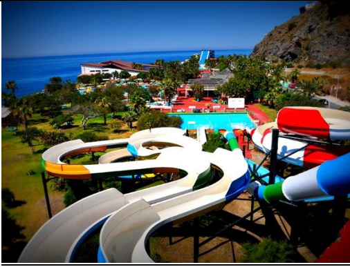
Aquatropic Water Park

Family-oriented leisure center with tube & toboggan rides into splash pools & casual outdoor eats. Address: Paseo Reina Sofía, S/N, 18690 Almuñécar, Granada Hours: Open · Closes 7 PM Confirmed by phone call 7 days ago Phone: 958 63 20 81 Province: Granada https://www.aqua-tropic.com/