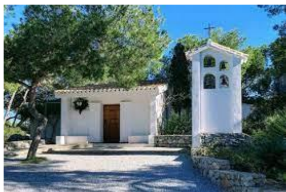
The Hermitage of Punta de la Mona

Location: https://goo.gl/maps/T5w8bqZeDuK7Xt6U6