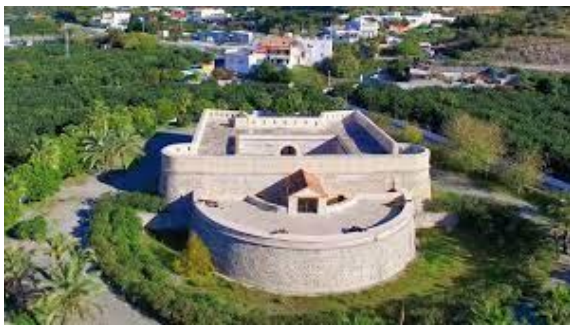
La Herradura Castle

Location: https://goo.gl/maps/RK4rcUkGKtvTn5iD7 , https://goo.gl/maps/tMc74pAydQmr85C67 and https://goo.gl/maps/JooMp41URqV4SEwv7 .