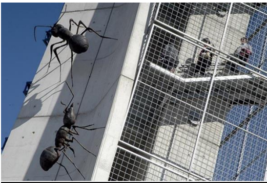
Exploring Granada: Science Park

Parque de las Ciencias is a science centre and museum, part of the European Network of Science Centers and Museums, located in the city of Granada, Andalusia, Spain. Under the motto "A new kind of Museum", Parque de las Ciencias was founded in 1990 and opened in 1995.