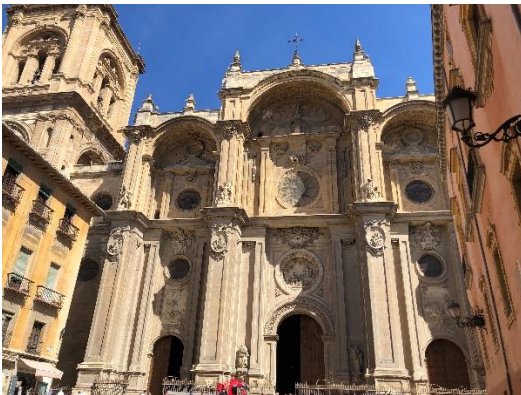
Exploring Granada: Cathedral

The cathedral's construction was started in 1501 by order of the Catholic royal couple, after Granada had been retaken from the Arabs by the Christians in 1492. The cathedral was built on the former site of a mosque and the burial chapel for the kings was completed first. For a time, the old mosque served as a cathedral. The following decades, the cathedral was built in Renaissance style and finally put to use in 1561. Afterwards, the necessary changes and additions have occurred, such as the Baroque dome church Iglesia del Sagrario in the place of the planned second tower. For nearly 200 years, various architects laboured on the build of this cathedral, making the cathedral of Granada a mix of Renaissance and Gothic styles.