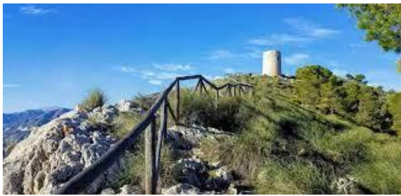
Watchtower and Cerro Gordo Viewpoint

Location: https://goo.gl/maps/Pa5ph2r4vC8GAovLA