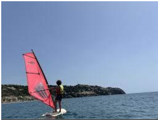
Paddle / Windsurfing

Do you want to learn to sail? There are initiation courses from 8 years old in windsurfing, light sailing and catamaran. After one of our 5-hour courses you will have the necessary notions to navigate autonomously in moderate conditions. The courses can be done individually, as a group or as a family and distribute the hours over different days depending on the weather conditions or the availability of each student.