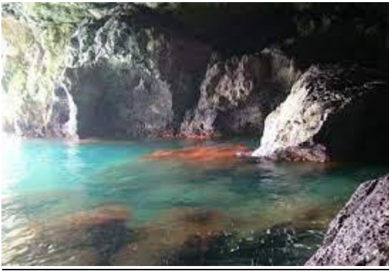
Las Palomas Cave

Do you like the beach and water sports? Then you should visit the Cueva de las Palomas, accessible by kayak as you have to reach it by water. Located south of the cliffs of the Natural Park of Cerro Gordo we find this opening of about 15 metres high and 4 metres wide in which you can enter up to 8 metres above the sea level.