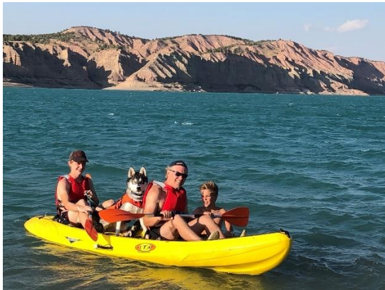
Kayak & Snorkel

Location: https://goo.gl/maps/8AoN9s1eCEUNQfVdZ