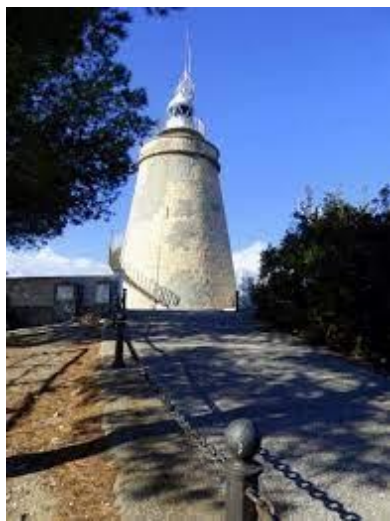
Lighthouse of La Herradura

Just 2 kilometres from the castle of La Herradura we find this lighthouse, also known as Faro de Punta de Mona, due to its location. Although if we visit it we will notice that the construction is not very old, it is based on a historical base of great historical value. In this same place there was a Muslim defensive tower on top of which the current one was built, dating from the 18th century.