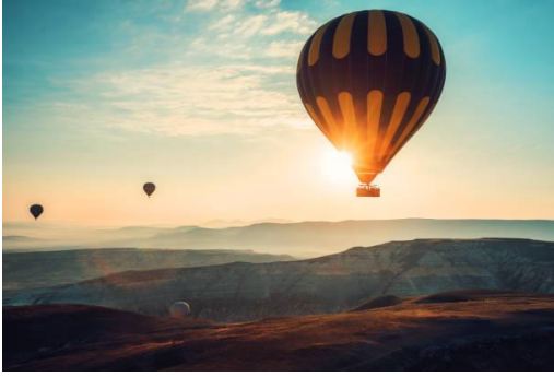
Hot Air Ballooning

Experience one of the most beautiful regions of the Iberian Peninsula from the air, with this wonderful hot air balloon flight in Guadix, a 75 minute drive from La Heradura. The adventure begins bright and early: first the experts inflate the balloon together with you, then they check the wind and prepare the basket. Once everything is ready, they'll ignite the burner and let the warm air lift us gently heavenwards. The direction of our journey will depend on the wind, but whether floating in silence over the magnificent Guadix Cathedral, or admiring the ancient iron-ore mines of Alquife, or the white chimneys of Guadix's iconic cave dwellings, this is a flight where excitement and stunning views are guaranteed, with the white peaks of the Sierra Nevada as a spectacular, ever-present back-drop. Upon landing, you can celebrate the flight with a traditional breakfast - the perfect climax to a magical experience.